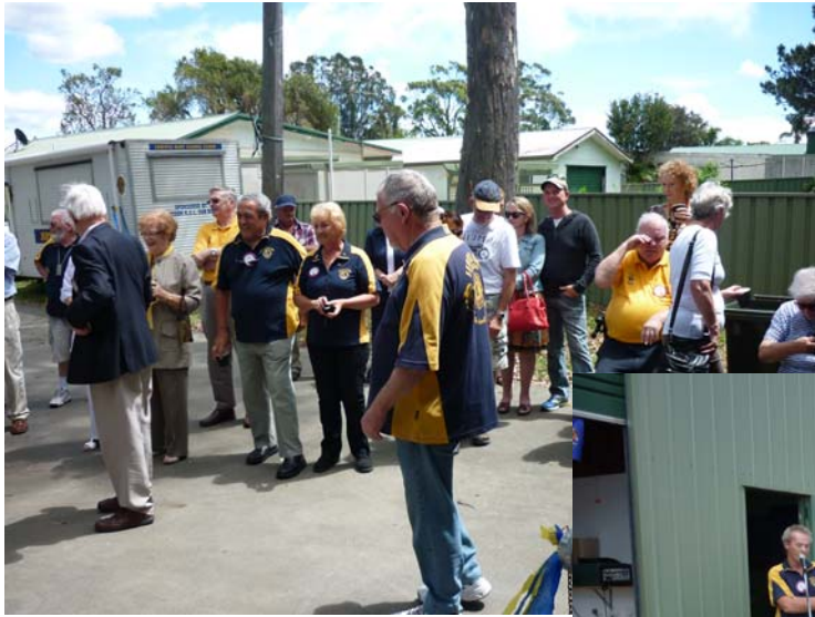
Crowd scenes from Wendy's camera